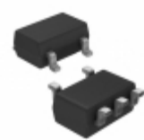
S-1740A17-M5T1U4 SII Semiconductor Corporation IC REG LINEAR 1.7V 100MA SOT23-5