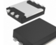
S-1740A10-A6T2U4 SII Semiconductor Corporation IC REG LINEAR 1V 100MA HSNT6-B