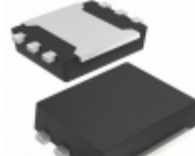
S-1740A17-A6T2U4 SII Semiconductor Corporation IC REG LINEAR 1.7V 100MA HSNT6-B