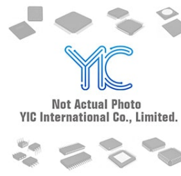
S-1731A1833-A6T1S SEIKO S-1731A1833-A6T1S SEIKO