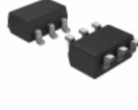
S-1721E3312-M6T1G SII Semiconductor Corporation IC REG LIN 1.2V/3.3V 0.15A SOT23