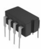
LT1242MJ8 ADI (Analog Devices, Inc.) IC PWM CTRLR CURR MODE CERDIP