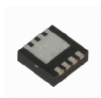
IRFH5204TRPBF International Rectifier (Infineon Technologies) MOSFET N-CH 40V 22A PQFN