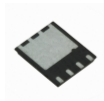
IRFH5206TR2PBF International Rectifier (Infineon Technologies) MOSFET N-CH 60V 16A 5X6 PQFN