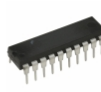
DM74LS573N Fairchild/ON Semiconductor IC LATCH OCTAL D-TYPE 3ST 20-DIP