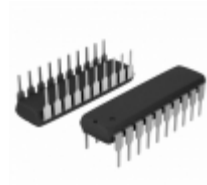
DM74LS574N AMI Semiconductor / ON Semiconductor IC FF D-TYPE SNGL 8BIT 20DIP