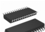
AT28HC64B-70SU Microchip Technology IC EEPROM 64KBIT 70NS 28SOIC