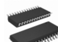
AT28HC64B-70SC Microchip Technology IC EEPROM 64KBIT 70NS 28SOIC