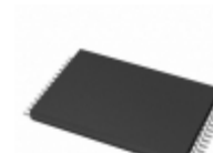
AT28HC64B-70TC Microchip Technology IC EEPROM 64KBIT 70NS 28TSOP