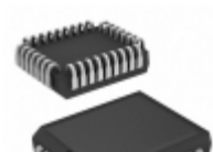
AT28HC64B-90JA Microchip Technology IC EEPROM 64KBIT 90NS 32PLCC