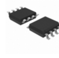
AT17C256-10NC Micrel / Microchip Technology IC EEPROM FPGA 256KB 8-SOIC