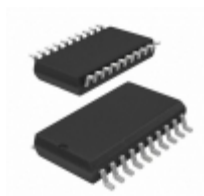
AT17C128-10SI Micrel / Microchip Technology IC EEPROM FPGA 128KB 20-SOIC