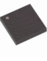
AT17C256-10CC Micrel / Microchip Technology IC SRL CONFIG EEPROM 256K 8LAP