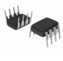
AT17C128-10PI Micrel / Microchip Technology IC SERIAL CONFIG PROM 128K 8DIP