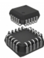
AT17C128A-10JC Micrel / Microchip Technology IC SER CONFIG PROM 128K 20PLCC