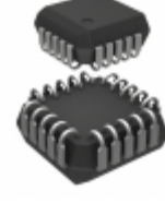
AT17C256-10JI Micrel / Microchip Technology IC SER CONFIG PROM 256K 20PLCC