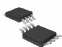
LTC1550LCMS8-2.5#TRPBF Linear Technology / Analog Devices IC REG SWITCHED CAP INV 8MSOP