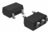
AOZ6115CI Alpha and Omega Semiconductor, Inc. IC ANLG SWITCH SPST SOT23-5