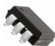
ASSR-4119-301E Avago Technologies (Broadcom Limited) RELAY SSR SPST SGL 0.10A 6SMD GW