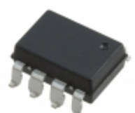
ASSR-4128-502E Avago Technologies (Broadcom Limited) RELAY SSR DPST .10A 8SMD GW