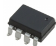
ASSR-4128-302E Avago Technologies (Broadcom Limited) RELAY SSR DPST .10A 8SMD GW