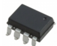
ASSR-4120-502E Avago Technologies (Broadcom Limited) RELAY SSR DPST .12A 8SMD GW