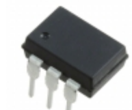
ASSR-4119-001E Avago Technologies (Broadcom Limited) RELAY SSR SPST SGL 0.10A 6DIP