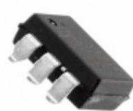
ASSR-4119-501E Avago Technologies (Broadcom Limited) RELAY SSR SPST SGL 0.10A 6SMD GW