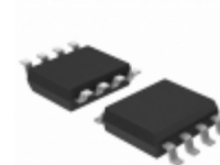
BR24S64FJ-WE2 LAPIS Semiconductor IC EEPROM 64KBIT 400KHZ 8SOP-J