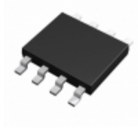
BR24S32FVJ-WE2 LAPIS Semiconductor IC EEPROM 32KBIT 400KHZ 8TSOP