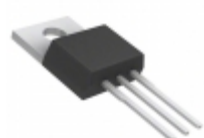
FFP20UP20DNTU Fairchild/ON Semiconductor DIODE ARRAY GP 200V 10A TO220