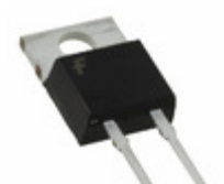
FFP30S60STU AMI Semiconductor / ON Semiconductor DIODE GEN PURP 600V 30A TO220-2L