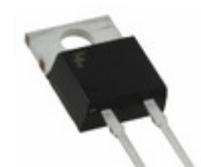
FFP30S60STU Fairchild/ON Semiconductor DIODE GEN PURP 600V 30A TO220-2L