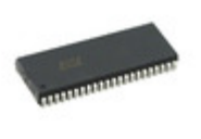
IS61WV25616BLL-10KLI-TR ISSI, Integrated Silicon Solution Inc IC SRAM 4MBIT 10NS 44SOJ