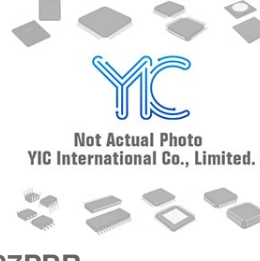
RT9198-27PBR VB RT9198-27PBR VB