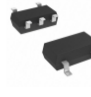
RT9198-28GBR Richtek IC REG LDO 2.8V 0.3A SOT23-5