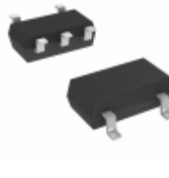
RT9198-28GU5R Richtek IC REG LDO 2.8V 0.3A SC70-5R