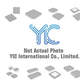
RT9198-28PBR RICHTEK RT9198-28PBR RICHTEK