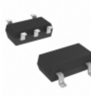
RT9198-27GBR Richtek IC REG LDO 2.7V 0.3A SOT23-5