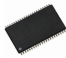
IS61WV12816BLL-12TLI-TR ISSI, Integrated Silicon Solution Inc IC SRAM 2MBIT 12NS 44TSOP