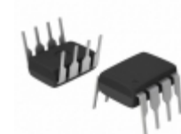
LBA126 IXYS Integrated Circuits Division RELAY OPTOMOS 170MA DP 8-DIP