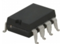
LBA120PTR IXYS Integrated Circuits Division RELAY OPTOMOS 170MA DP 8FLTPK