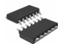
LT1639IS#TRPBF Linear Technology / Analog Devices IC OPAMP GP 1.2MHZ RRO 14SO