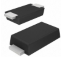
VS-2EJH02-M3/6A Electro-Films (EFI) / Vishay DIODE GEN PURP 200V 2A DO221AC