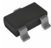
AP432WL-7 Diodes Incorporated IC VREF SHUNT ADJ SC59