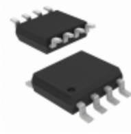
AP43331NMTR-G1 Diodes Incorporated ACDC DECODER,SO-8,T&R,4K