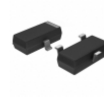
AP4340NTR-G1 Diodes Incorporated IC ACDC PSR ACCEL SOT23