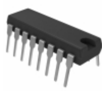
DS1238-5 Maxim Integrated IC MICROMAN W/FRESH 5% 16-DIP