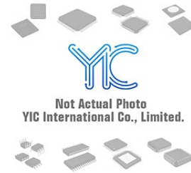
LTC1442CS8#TR LT LTC1442CS8#TR LT