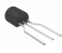
AS431IAZTR-G1 Diodes Incorporated IC VREF SHUNT ADJ TO92