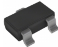
AS431HMANTR-G1 Diodes Incorporated IC VREG SHUNT REGULATOR SOT23