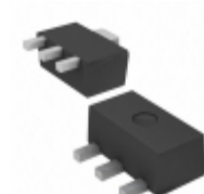
AS431IARTR-G1 Diodes Incorporated IC VREF SHUNT ADJ