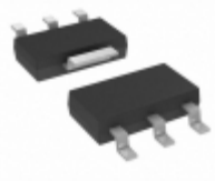
AP7361-12ER-13 Diodes Incorporated IC REG LDO 1.2V 1A SOT223