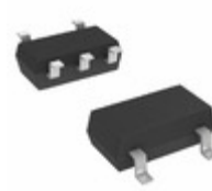
AP7354D-45W5-7 Diodes Incorporated IC LDO CMOS LOWCURR SOT25