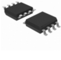
AT24C01A-10SU-2.7-T Micrel / Microchip Technology IC EEPROM 1KBIT 400KHZ 8SOIC