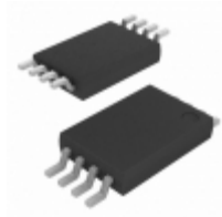
AT24C01A-10TI-1.8-T Micrel / Microchip Technology IC EEPROM 1KBIT 400KHZ 8TSSOP