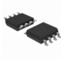
AT24C01A-10SU-2.7 Micrel / Microchip Technology IC EEPROM 1KBIT 400KHZ 8SOIC