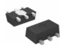
S-1135C24-U5T1U SII Semiconductor Corporation IC REG LINEAR 2.4V 0.3A SOT89-5