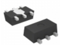
S-1135C25-U5T1U SII Semiconductor Corporation IC REG LINEAR 2.5V 0.3A SOT89-5