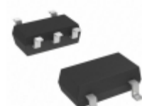
S-1135C24-M5T1U SII Semiconductor Corporation IC REG LINEAR 2.4V 0.3A SOT23-5