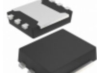
S-1135C24-A6T1U SII Semiconductor Corporation IC REG LINEAR 2.4V 0.3A HSNT-6A