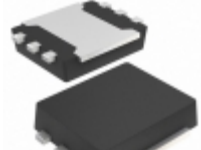
S-1135C26-A6T1U SII Semiconductor Corporation IC REG LINEAR 2.6V 0.3A HSNT-6A