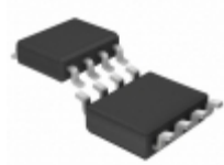
LTC1197IS8#PBF Linear Technology / Analog Devices IC A/D CONV 10BIT W/SHTDWN 8-SOIC