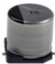
EEE-TG1H101UP Panasonic Electronic Components CAP ALUM 100UF 20% 50V SMD