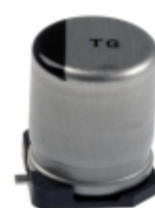
EEE-TG1E471Q Panasonic Electronic Components CAP ALUM 470UF 20% 25V SMD