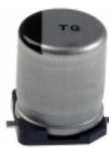
EEE-TG1E681M Panasonic Electronic Components CAP ALUM 680UF 20% 25V SMD