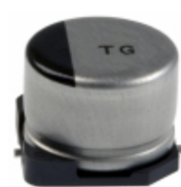
EEE-TG1E470P Panasonic Electronic Components CAP ALUM 47UF 20% 25V SMD