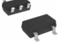
S-8352A50MC-K3JT2U SII Semiconductor Corporation IC REG CTRLR BOOST SOT23-5