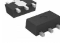
S-8352C30UA-K6PT2U SII Semiconductor Corporation IC REG CTRLR BOOST SOT89-3