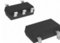
S-8352A54MC-K3NT2U SII Semiconductor Corporation IC REG CTRLR BOOST SOT23-5