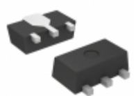
S-8352C30UA-K6PT2G SII Semiconductor Corporation IC REG CTRLR BOOST SOT89-3