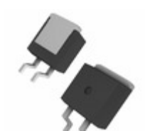
IXFA26N50P3 IXYS MOSFET N-CH 500V 26A TO-263AA