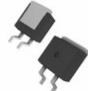
IXFA24N60X IXYS MOSFET N-CH 600V 24A TO-263