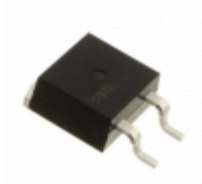
IXFA22N65X2 IXYS MOSFET N-CH 650V 22A TO-263