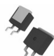
IXFA22N60P3 IXYS Corporation MOSFET N-CH