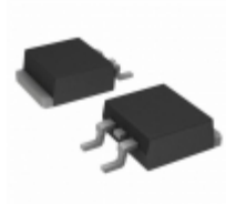
IXFA270N06T3 IXYS 60V/270A TRENCHT3 HIPERFET MOSFE