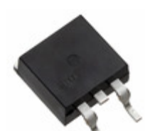
IXFA30N25X3 IXYS Corporation MOSFET N-CHANNEL 250V 30A TO263