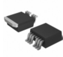
IXFA230N075T2-7 IXYS MOSFET N-CH 75V 230A TO-263-7