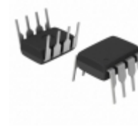
LTC1152IN8#PBF ADI (Analog Devices, Inc.) IC OPAMP CHOPPER 700KHZ RRO 8DIP