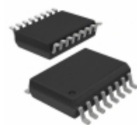
LTC1151CSW#TRPBF Linear Technology / Analog Devices IC OPAMP CHOPPER 2MHZ 16SO