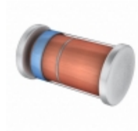
CLL4757A TR Central Semiconductor DIODE ZENER 51V 1W MELF