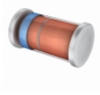
CLL4763A TR Central Semiconductor DIODE ZENER 91V 1W MELF