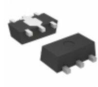
S-1137B27-U5T1G SII Semiconductor Corporation IC REG LINEAR 2.7V 0.3A SOT89-5