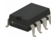
PAA190S IXYS Integrated Circuits Division RELAY OPTOMOS DUAL 150MA 8-SMD