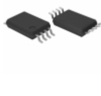
BR24T32FV-WE2 LAPIS Semiconductor IC EEPROM 32KBIT 400KHZ 8SSOPB