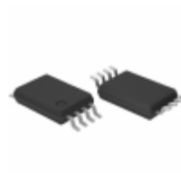
BR24T256FV-WE2 LAPIS Semiconductor IC EEPROM 256KBIT 400KHZ 8SSOPB