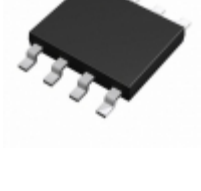
BR24T32FVM-WTR LAPIS Semiconductor IC EEPROM 32KBIT 400KHZ 8MSOP