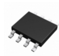
BR24T32FVJ-WE2 LAPIS Semiconductor IC EEPROM 32KBIT 400KHZ 8TSSOP