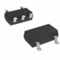
S-1135D27-M5T1U SII Semiconductor Corporation IC REG LINEAR 2.7V 0.3A SOT23-5