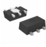
S-1135D28-U5T1G SII Semiconductor Corporation IC REG LINEAR 2.8V 0.3A SOT89-5