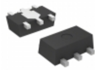
S-1135D27-U5T1G SII Semiconductor Corporation IC REG LINEAR 2.7V 0.3A SOT89-5