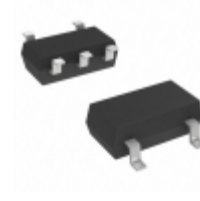
S-1135D29-M5T1U SII Semiconductor Corporation IC REG LINEAR 2.9V 0.3A SOT23-5