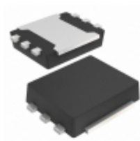
S-1135D29-A6T1U SII Semiconductor Corporation IC REG LINEAR 2.9V 0.3A HSNT-6A