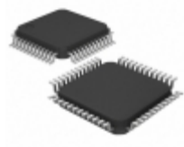
AD7675ASTZ ADI (Analog Devices, Inc.) IC ADC 16BIT DIFF INP 48LQFP