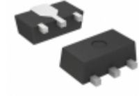
S-1206B24-U3T1G SII Semiconductor Corporation IC REG LINEAR 2.4V 0.25A SOT89-3