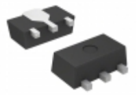
S-1206B24-U3T1U SII Semiconductor Corporation IC REG LINEAR 2.4V 0.25A SOT89-3