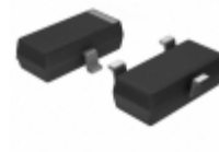
S-1206B24-M3T1U SII Semiconductor Corporation IC REG LINEAR 2.4V 0.25A SOT23-3