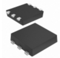
S-1206B24-I6T2U SII Semiconductor Corporation IC REG LIN 2.4V 0.25A SNT-6A(H)