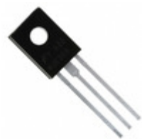
MJE170STU Fairchild/ON Semiconductor TRANS PNP 40V 3A TO-126