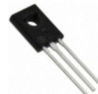
MJE171G ON Semiconductor TRANS PNP 60V 3A TO225AA