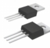
MJE15034G ON Semiconductor TRANS NPN 350V 4A TO220AB