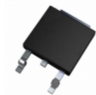
L78M06ACDT-TR STMicroelectronics IC REG LDO 6V 0.5A DPAK