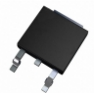
L78M06ABDT-TR STMicroelectronics IC REG LDO 6V 0.5A DPAK