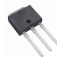
L78M05TL-TL-E ON Semiconductor IC REG LDO 5V 0.5A S363