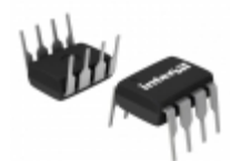
X9313UPZ Intersil IC DGTPL POT 32POS 50K UP/DN 8DIP