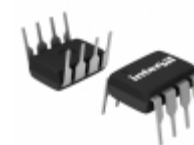
X9313UPI Intersil IC XDCCP 32-TAP 50K 3-WIRE 8-DIP