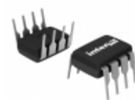
X9313UP Intersil IC XDCCP 32-TAP 50K 3-WIRE 8-DIP