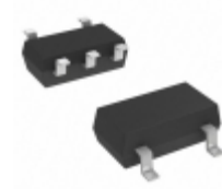
S-8352A54MC-K3NT2U SII Semiconductor Corporation IC REG CTRLR BOOST SOT23-5