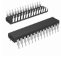
LTC1597-1BCN#PBF Linear Technology / Analog Devices IC CONV D/A 16BIT PAR 28-DIP