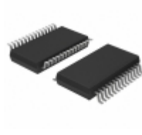
LTC1597-1AIG#TRPBF Linear Technology / Analog Devices IC D/A CONV 16BIT PAR 28-SSOP