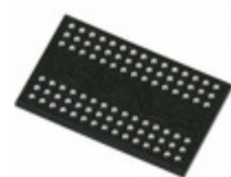
MT46H4M32LFB5-6 AT:K Micron Technology Inc. IC SDRAM 128MBIT 167MHZ 90VFBGA