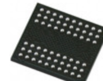
MT46H64M16LFBF-5 AIT:B TR Micron Technology Inc. IC SDRAM 1GBIT 200MHZ 60VFBGA