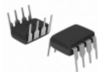
PAA140 IXYS Integrated Circuits Division RELAY OPTO 2 CHANNEL NO/NO 8-DIP