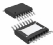
LT1765EFE-2.5#TRPBF Linear Technology / Analog Devices IC REG BUCK 2.5V 3A 16TSSOP