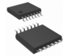
74VHC74MTCX Fairchild/ON Semiconductor IC D-TYPE POS TRG DUAL 14TSSOP