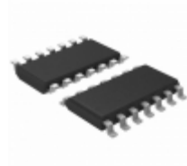
74VHC74MX Fairchild/ON Semiconductor IC D-TYPE POS TRG DUAL 14SOIC