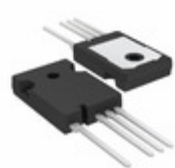
FGH40T120SMDL4 Fairchild/ON Semiconductor IGBT 1200V 80A 555W TO247-3