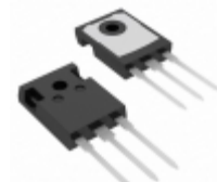
FGH40T120SMD Fairchild/ON Semiconductor IGBT 1200V 80A 555W TO247-3