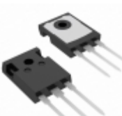
FGH40T100SMD Fairchild/ON Semiconductor IGBT 1000V 80A 333W TO247-3