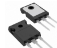
FGH40T120SMD-F155 AMI Semiconductor / ON Semiconductor IGBT 1200V 80A 555W TO247-3