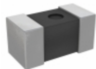
LQP03TN0N6B02D Murata Electronics North America FIXED IND 0.6NH 850MA 70 MOHM