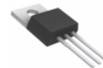
FGP30N6S2D Fairchild/ON Semiconductor IGBT 600V 45A 167W TO220AB