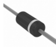
FGP30DHE3/54 Electro-Films (EFI) / Vishay DIODE GEN PURP 200V 3A DO204AC