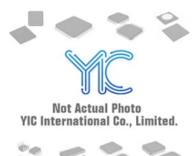
MT48H16M32LFB5-6IT:C Micron Micron FBGA