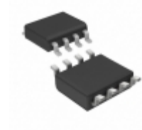
STM813LM6F STMicroelectronics SUPERVISOR 5V WATCHDOG 8SOIC