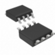
STM813LM6E STMicroelectronics IC SUPERVISOR SWITCH OVER 8-SOIC