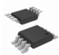
STM813LDS6F STMicroelectronics IC SUPERVISOR 5V 4.63V 8-TSSOP