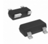
STM812SW16F STMicroelectronics IC MPU RESET CIRC 2.93V SOT143-4